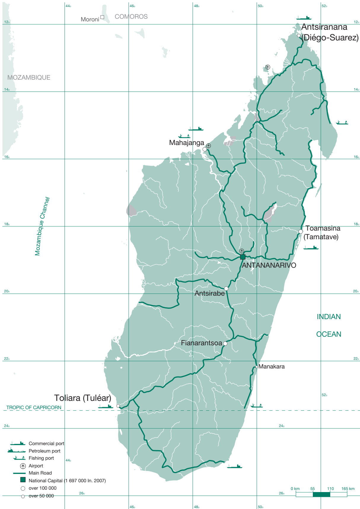
This map is for illustrative purposes and is without prejudice to the status of or sovereignty over any territory covered by this map.